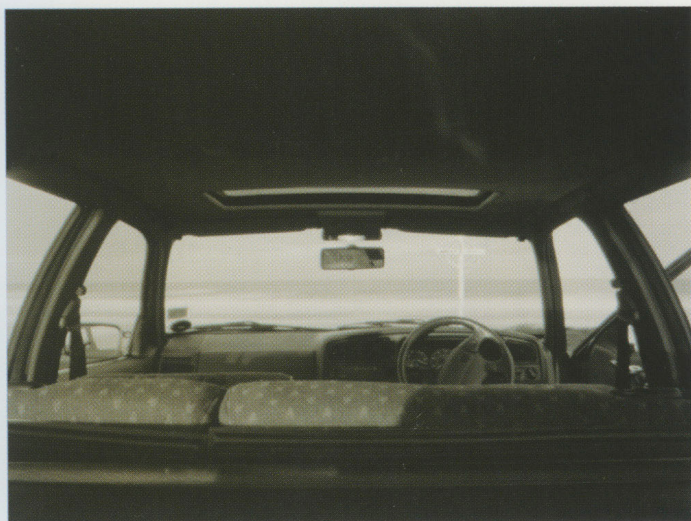
Cocklawburn 2000 Fiona Crisp

I then started using pin-hole cameras with large-format film – something I had done on different occasions in the past – and I began to move further afield up and down the coast, sometimes literally looking back at Berwick, trying to conceptually assimilate what I felt Berwick was.