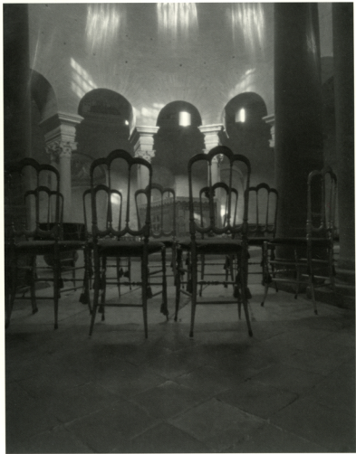
FIONA CRISP Santa Costanza 2002 black & white photograph on aluminium with coloured aluminium frame, 151 x 121 x 3 cm